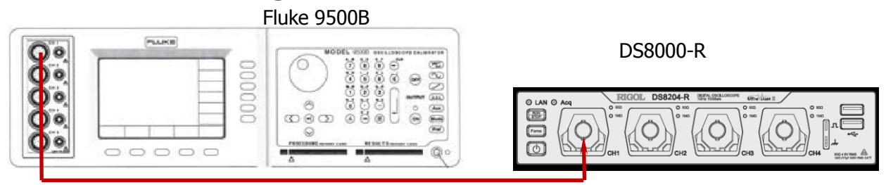
Figure 2-2 DC Gain Accuracy Test Connection Diagram