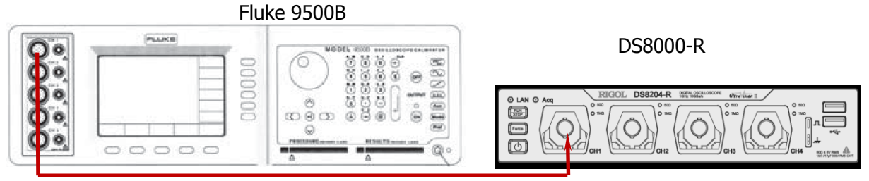
Figure 2-5 Timebase Accuracy Test Connection Diagram