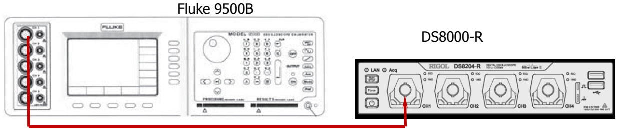
Figure 2-4 Bandwidth Limit Test Connection Diagram