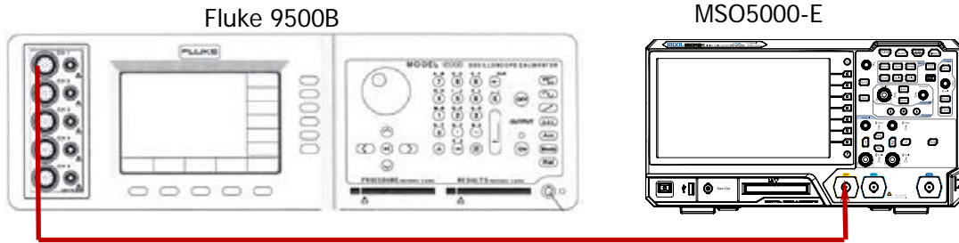
Figure 2-1 Impedance Test Connection Diagram