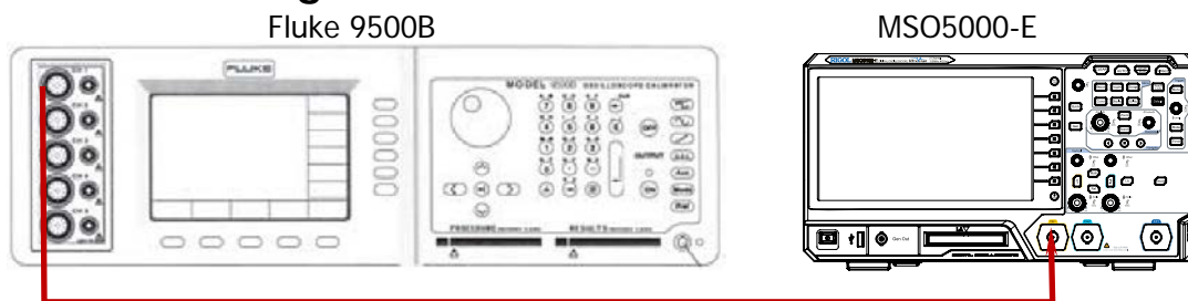
Figure 2-4 Bandwidth Limit Test Connection Diagram