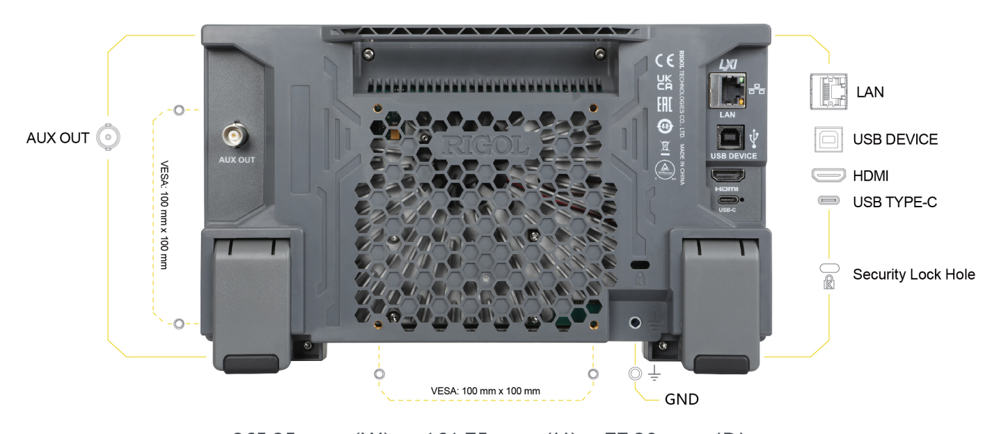
265.35 mm (W) \times 161.75 mm (H) \times 77.38 mm (D)