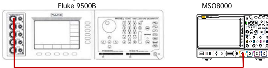
Figure 2-3 Bandwidth Test Connection Diagram