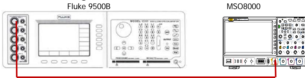
Figure 2-5 Timebase Accuracy Test Connection Diagram