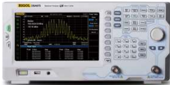
DSA875-TG Spectrum Analyzer