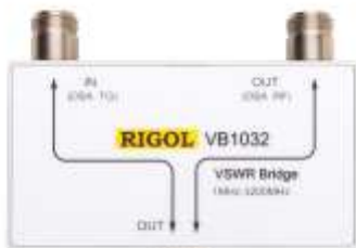
VB1032 VSWR Bridge