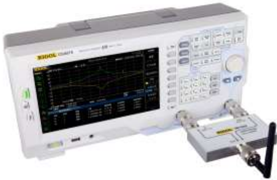
DSA875-TG Spectrum Analyzer and VB1032 VSWR Bridge