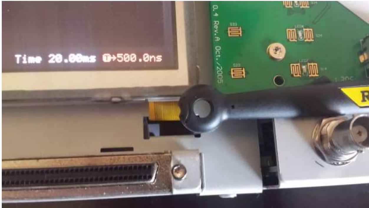
Figure 4: Measuring a display ribbon cable for emissions using an H field probe.

You can use tinfoil or conductive tape to cover suspected problem areas like vents, covers, doors, seams, and cables coming through an enclosure. Simply test the area without the foil or tape, then cover the suspected area, and rescan with the probe.