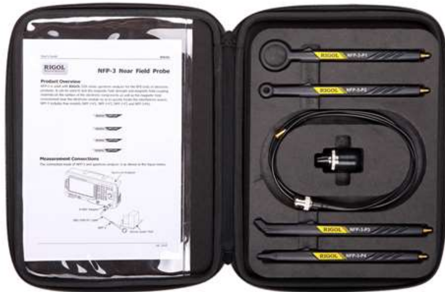
Figure 2: Rigol NFP -3 EMC probes.

A commercial example of near field probes are the Rigol NFP-3 probes shown below: